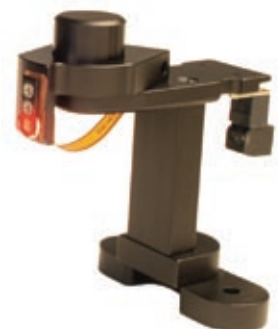
Ballantyne Model 7