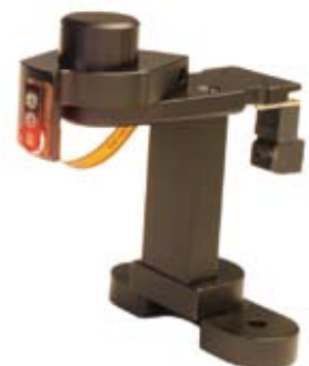
Ballantyne Model 7